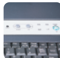
Port Up/ Port Down Switches