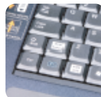
Dedicated OSD and OSD Toolbar Invocation Keys