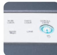
Extra PS/2 Mouse Port