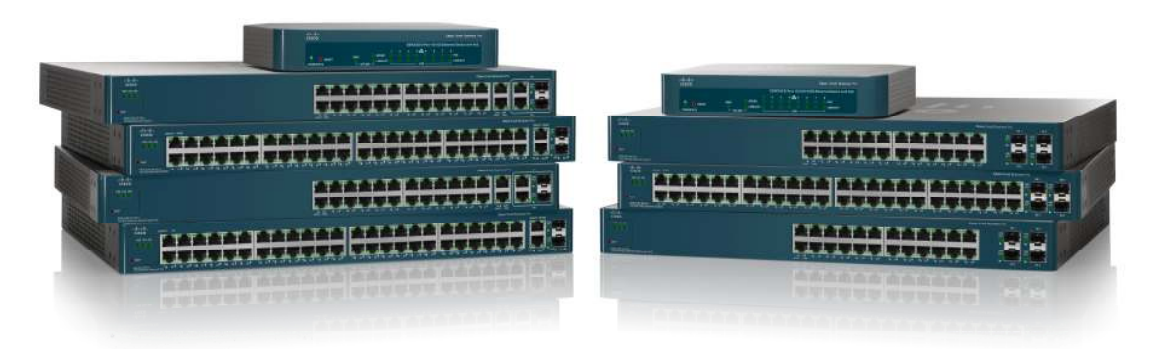
Figure 1. Cisco ESW 500 Series Switches

Figure 1 shows the portfolio of Cisco ESW 500 Series Switches.