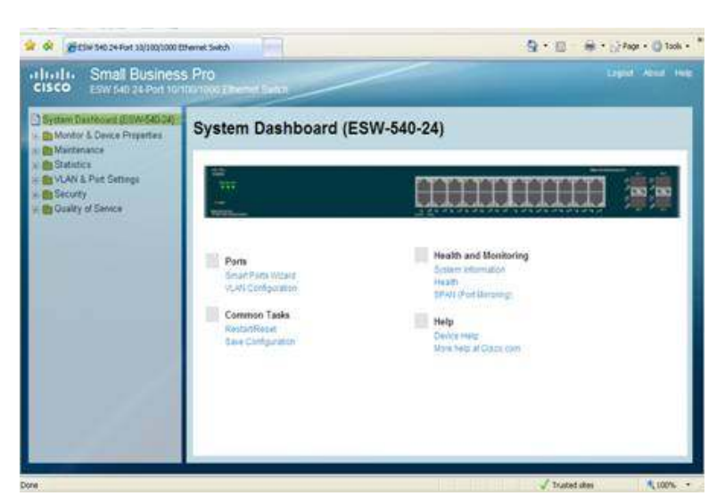
Figure 3. Cisco ESW 500 Configuration Utility

For systemwide deployments, you can use the Cisco Configuration Assistant, a GUI-based application that configures all of the devices that are part of the Small Business Pro Series as well as the Cisco Smart Business Communications System. Both the embedded Configuration Utility and Cisco Configuration Assistant feature Cisco Discovery Protocol to automatically discover all Cisco devices and allow them to share information about one another. The tools also employ Cisco Smartports technology, which provides preset options for quickly configuring all ports on a Cisco ESW 500 Series Switch, including QoS and security features (Figure 4). Once the network is deployed, Cisco Configuration Assistant can generate status reports, synchronize passwords, and upgrade software across all of your Cisco network devices. All of these features reduce the time and effort your staff must devote to network deployment and troubleshooting, so that they can focus on your business priorities. Cisco Configuration Assistant is available for download free of charge at http://www.cisco.com/go/configassist.